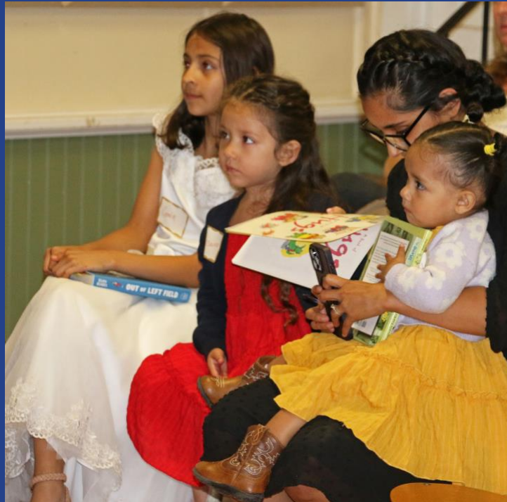
Children at Stories Together were given books to take home.

Recently, 50 readers, partners, and their families gathered at the Reformed Church of New Paltz